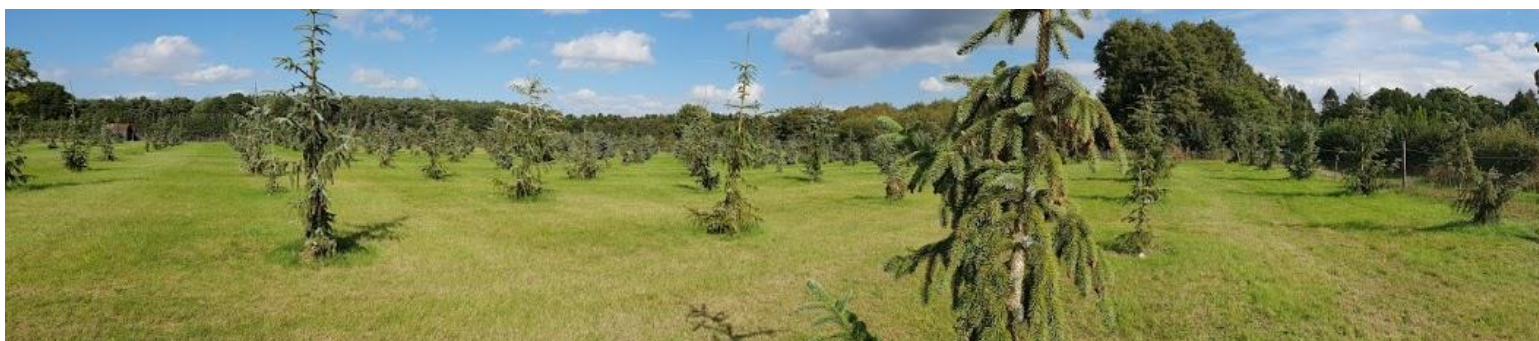
The seed orchard, Maelor nurseries.