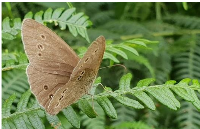
Speckled wood, Wapley Hill Wood. EMH 2018